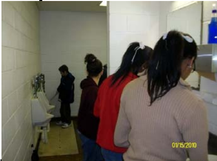
Teens working on sanitizing bathrooms and having fun!